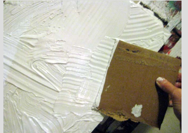
Applying the gesso.