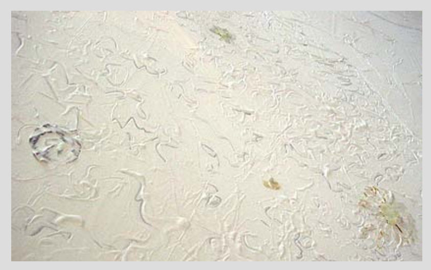
Dried gesso with leaves and flowers.