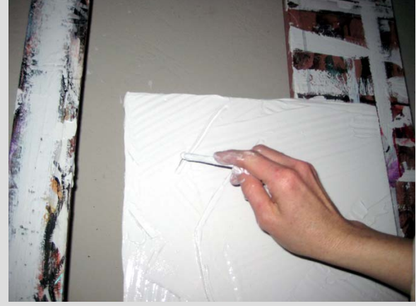
Drawing the image.